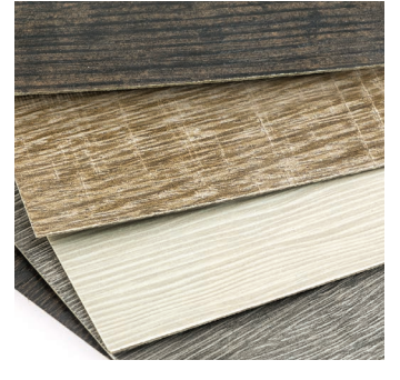
TSS veneers available in all colors (texture differs from doors).