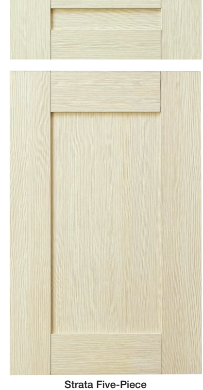
Strata Five-Piece (19 colors available)