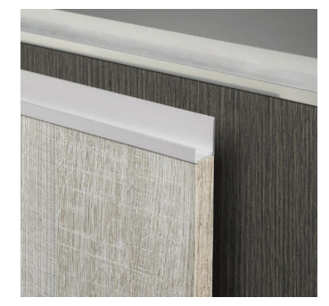
Hand pull in natural aluminum and polished chrome.