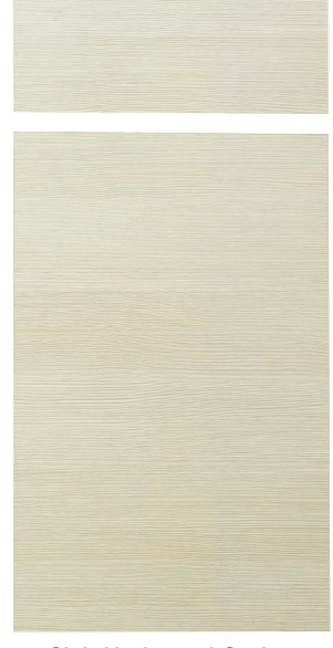
Slab Horizontal Option

A highly durable material featuring a wide variety of textured surfaces that are thermally fused and heat stamped onto a CARB compliant core.