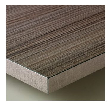
Stainless steel edgeband available with all colors.