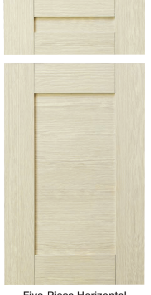
Five-Piece Horizontal Panel Option