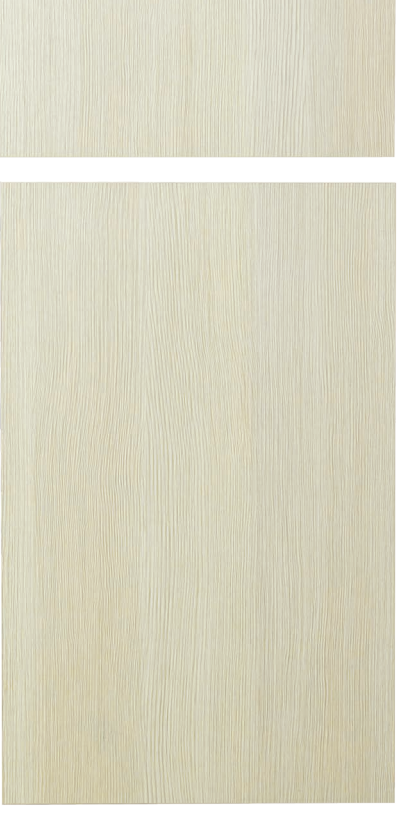
Strata Slab (26 colors available)