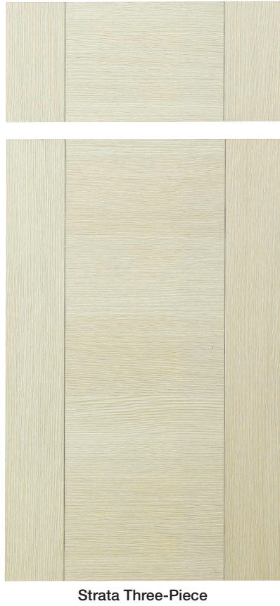
Strata Three-Piece (26 colors available)