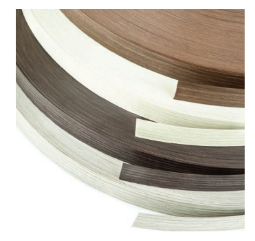
Rolls of matching edgeband in all TSS colors as well as stainless steel.